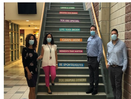
COVID-19 School and Child-Care Screening Tool

We have been made aware of a TikTok trend 'Devious Lick' where students vandalize school washrooms. We have reminded students of our collective responsibility to ensure that we have a safe and welcoming environment.